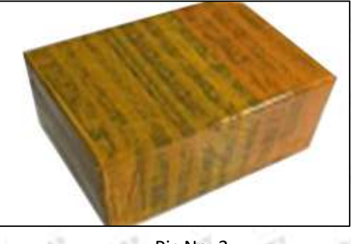
Pic No. 3 International express packaging: Wrapped with yellow tape after wrapping black protective film